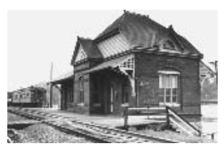
This picturesque Baltimore & Ohio Railroad station was built in 1884 in Laurel. Sole survivor of the county's Victorian railroad stations, it is a prominent symbol of transportation history.