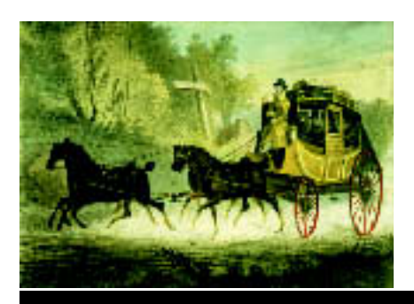
Public Summary Anacostia Trails Heritage Area Management Plan