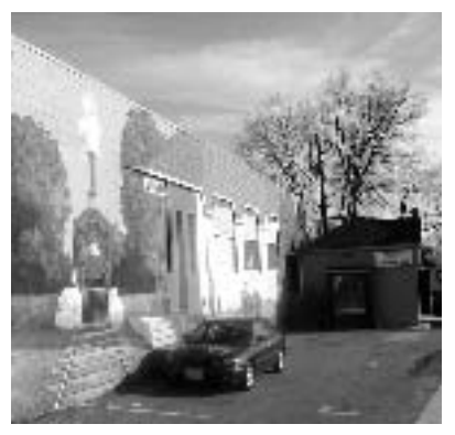
This mural was recently painted on a commercial facade on US 1 in Berwyn, celebrating the railroad history of this community.