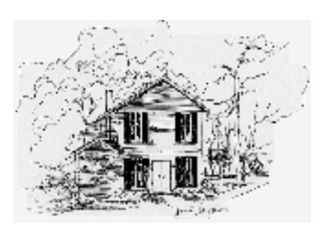
Abraham Hall, a benevolent society lodge built in 1889, has since that time been the focal point of the African-American community of Rossville.

The Northwest Branch is one of the two major tributaries of the Anacostia River and has the highest riverscape diversity and some of the most scenic spots in the Heritage Area. The Anacostia Tributary Trails