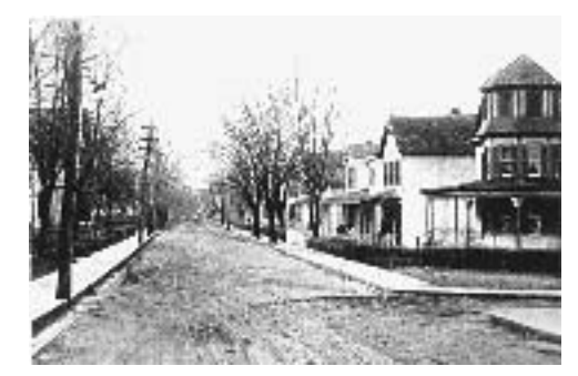
This early (circa 1910) photograph shows one of Hyattsville's streets, lined with Victorian houses.

Since 1975 the City of Laurel has recognized the historic resources in its community by creating the City of Laurel Historic District Commission. The Commission's Design Guidelines detail the requirements for rehabilitation of properties in order to receive property tax credits. This has been a rewarding program for the city and residents of Laurel, resulting in new facades along Main Street, rehabilitated properties and a focal point for such events as the Laurel Main Street Festival.