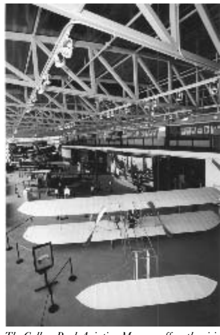
The College Park Aviation Museum offers the visitor impressive exhibits of early flying machines. It is one of a number of high-quality heritage sites that together attract an estimated half-million visitors a year.

M-NCPPC manages 18 neighborhood parks, 6 community centers, 4 playgrounds, 2 swimming pools, several ballfields, an ice rink,