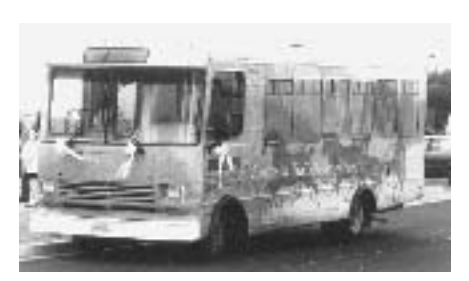
Buses "wrapped" with the Anacostia Trails Heritage Area logo are now carrying passengers in parts of the Heritage Area.

The vision of "car-free" touring in this area should be pursued. To this end, this plan supports the following activities: