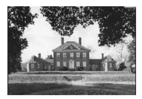
Montpelier Mansion, built for the Snowden family in the 1780s, is one of four National Historic Landmarks in the Heritage Area.