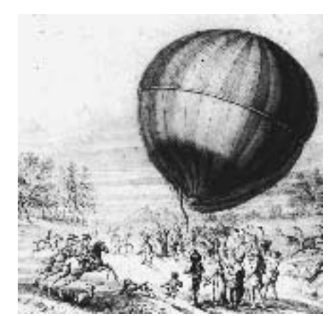
In 1784 Bladensburg was the site of the first unmanned balloon ascent in America.