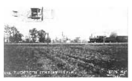
Each successive century has seen the development of a different mode of transportation. This 1909 photograph shows a Wright aeroplane flying over a train on the Baltimore & Ohio Railroad tracks near College Park Airport.