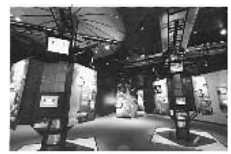
The Visitor Center at Goodard Space Flight Center has many interactive exhibits highlighting NASA milestones in space exploration.