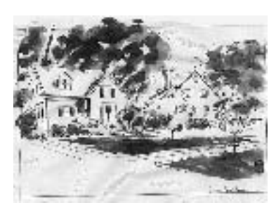
University Park streetscape.