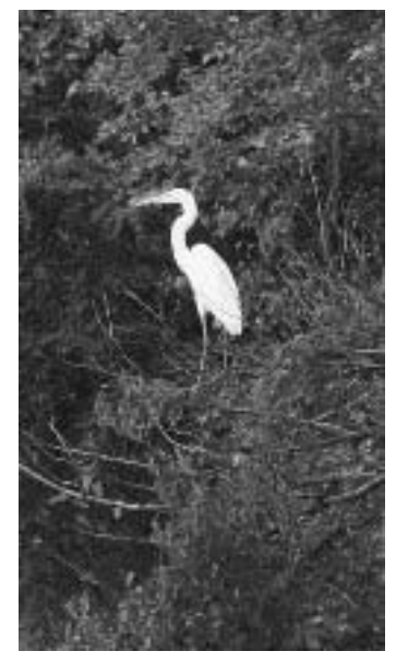
The elegant Common Egret is a familiar sight along the waterways of the Heritage Area.

The construction of new visitor centers in ATHA is not a part of the overall strategy, which relies on using the many existing visitor reception and interpretive sites already present. Actions here relate to the design of an overall signage system that would include wayfinding (directional) signs, outdoor interpretive signs, and distinctive kiosks at key locations to alert visitors to nearby sites and upcoming events. Public outreach programs would explain not only how and why to protect historic and natural resources, but could also spark enthusiasm for the resources themselves and the history and educational opportunities they represent. The following actions are recommended: