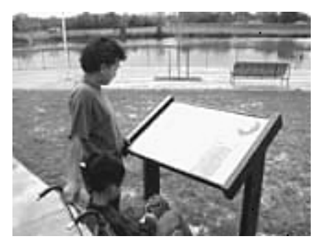
Interpretive signage like this at the Bladensburg Waterfront Park helps visitors enjoy and appreciate the area's historical and environmental attractions.