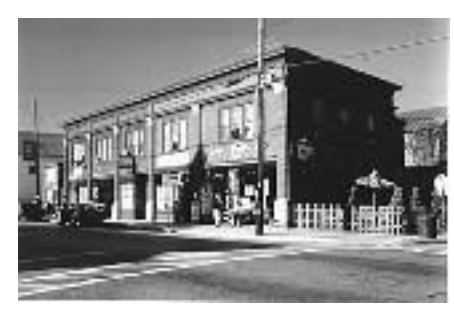
Downtown Mount Rainier exhibits interesting early commercial architecture, such as this five-part 1920s commercial/residential building on 34th Street.

The heritage tourism program in ATHA will be managed by the Redevelopment Authority of Prince George's County. Management of the heritage tourism program within the City of Laurel will be coordinated in accordance with the Memorandum of Understanding between the City of Laurel, ATHA, Inc., and the Redevelopment Authority of Prince George's County. ATHA, Inc., and Prince George's County will continue their partnership effort. ATHA Inc., will serve in a special advisory and advocacy capacity to the Redevelopment Authority. Each management entity will have the following responsibilities within its jurisdiction with regard to the heritage tourism program.