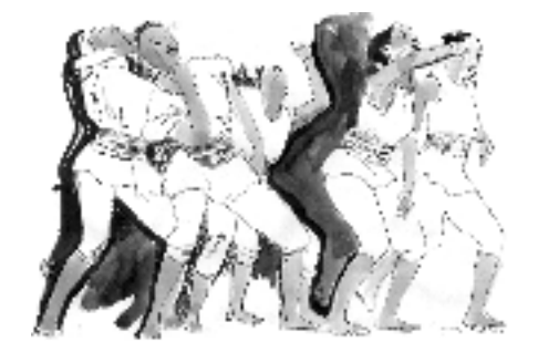
An African-American dance group performing at the Publick Playhouse, one of M-NCPPC's comprehensive art facilities.