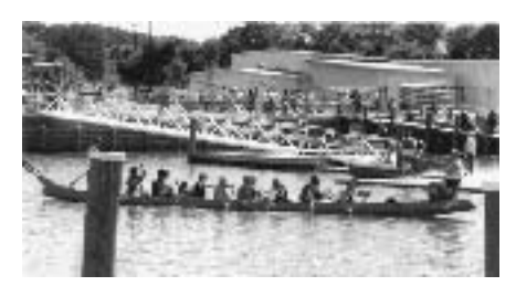
The Port Towns regatta at the Bladensburg waterfront.